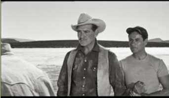
Must I be touched by nothing?