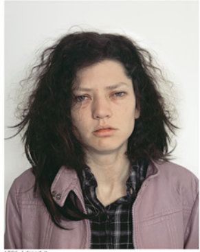
1986 / dread it