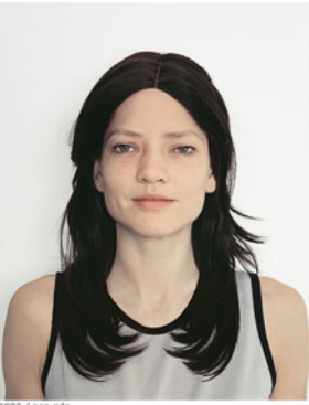
1983 / can ride